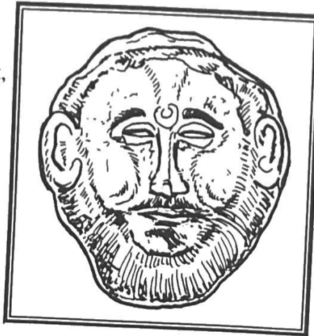
Death mask of a Mycenaean king

The Dorians dominated the Peloponnesus between 1100 and 800 B.C. This period is known as the Dark Age of Greece. The Dorians destroyed Mycenaean culture, but did not replace it with anything as grand. The Dark Age saw an end to palace-centered monarchs on the Peloponnesus.